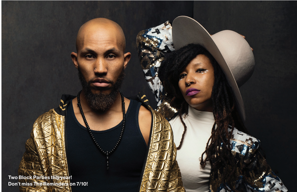
Two Block Parties this year! Don't miss The Reminders on 7/10!

energy leave crowds in awe the world over, allowing the duo to uplift and entertain all at once. Their unique mashup of razor-sharp rhymes; raw, soulful vocals; and reggae-tinged hip-hop beats form the perfect backdrop for their relevant and inspiring themes, leaving a lasting impression on listeners with audiences always wanting more. The Reminders take their hip-hop foundation and move it beyond genre, time, and space to create a global musical experience that is classic and speaks to all those who participate.