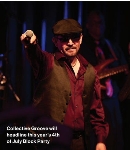
Collective Groove will headline this year's 4th of July Block Party

All music events will be outside. Early arrival recommended. Bring your own chairs, blankets, etc.