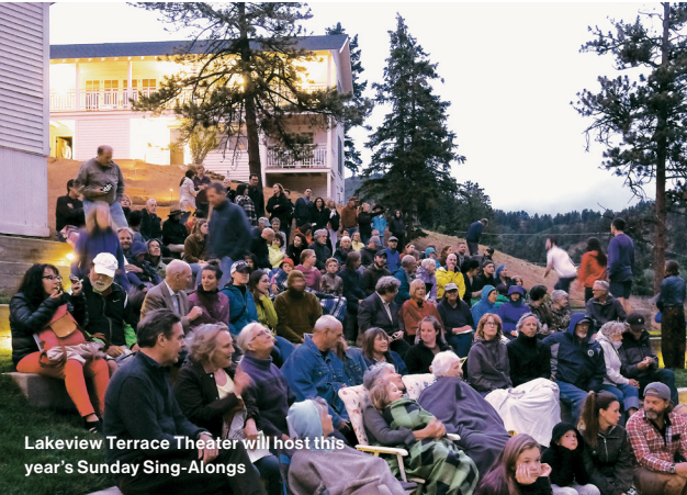
Lakeview Terrace Theater will host this year's Sunday Sing-Alongs

ARTDESK CONVERSATION: THE ART OF JAMES TURRELL 12 - 1 p.m. / LUNCH PROVIDED Church in the Wildwood