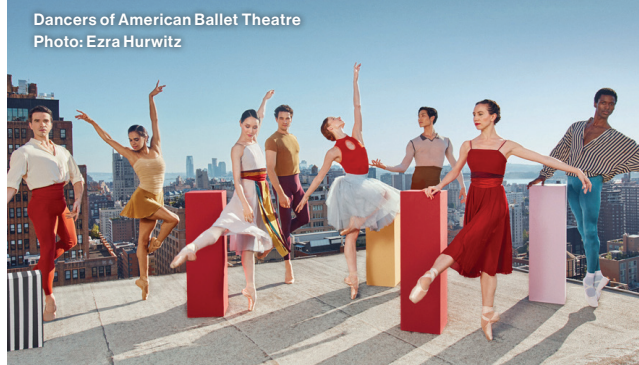
Dancers of American Ballet Theatre