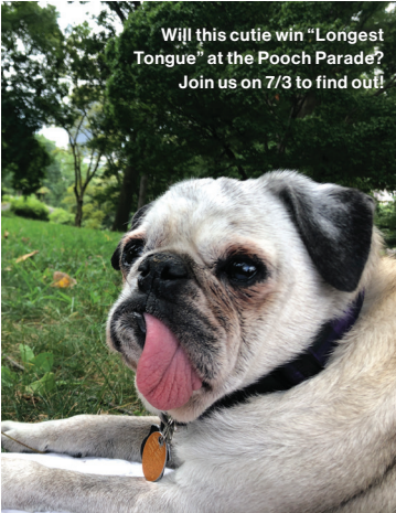
Will this cutie win "Longest Tongue" at the Pooch Parade? Join us on 7/3 to find out!

This summer, don't miss six unique opportunities to hear from and engage with some of today's best contemporaries! ArtDesk Conversations are highly anticipated events; these dynamic conversations cover the areas of music, art, dance, and various contemporary topics. Come engage with our speakers and hear from the elite in their fields as they discuss their creative processes, vision, and impact. You won't want to miss meeting this year's selected conversationalists!