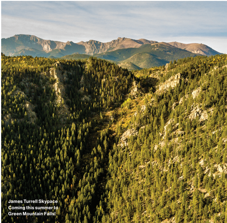
James Turrell Skyspace Coming this summer to Green Mountain Falls!