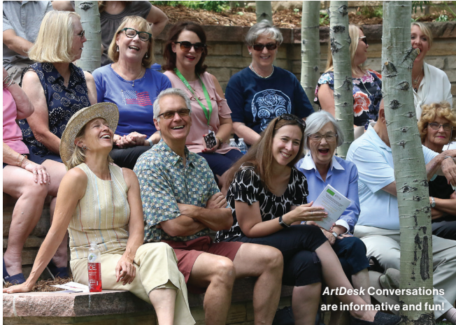
ArtDesk Conversations are informative and fun!

New to the Green Box Arts Festival this year, the Pooch Parade welcomes pups young and old on Saturday, July 3 at 1:30 p.m. to the Green Box Farm Stand for some fun in the sun! A family and pooch-friendly event, participants and spectators are sure to enjoy a parade around the lake, followed by awards for categories such as Best Dressed, Best Smile, Most Talkative, Waggiest Tail, and more! Visit greenboxarts.org for prize categories and to register for this pooch-perfect event!