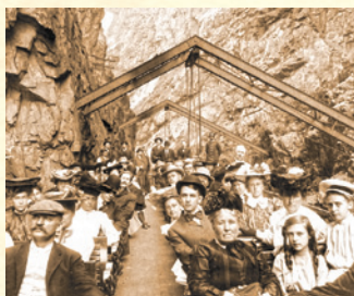
The strict "No Fun" policy has been lifted today!

In 1999 the tracks were purchased from the Union Pacific, allowing visitors from around the world to once again experience not only the Royal Gorge, but classic rail service, dining, and entertainment.