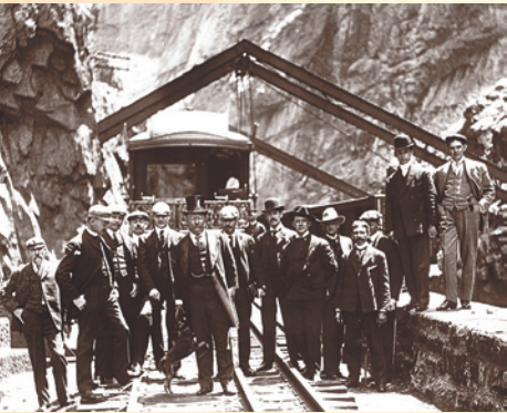
President Roosevelt at the Hanging Bridge

One step aboard the Royal Gorge Route and you'll know you've embarked upon one of Colorado's most treasured scenic railroads.