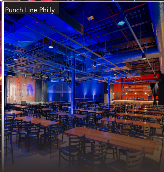
Punch Line Philly

EIGHT UNIQUE VENUES IN PHILADELPHIA ACCOMMODATING 20 TO 25,000 GUESTS