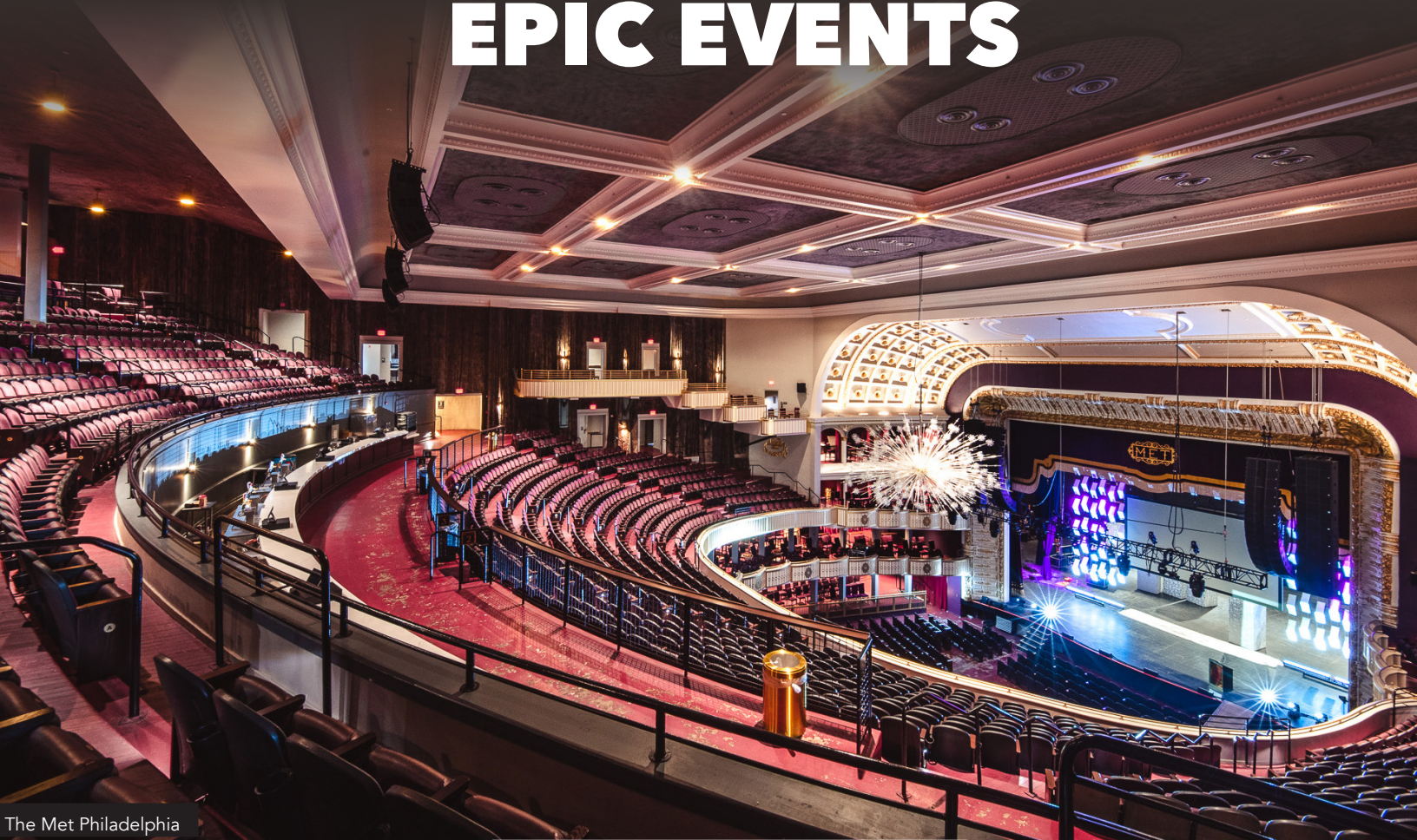
The Met Philadelphia