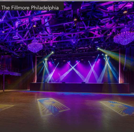
The Fillmore Philadelphia