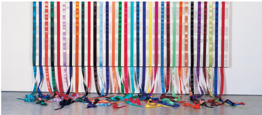
Tim Rollins and K.O.S., in collaboration with The Fabric Workshop and Museum, Philadelphia, (detail) Incidents in the Life of a Slave Girl (After Harriet Jacobs) , 1997.