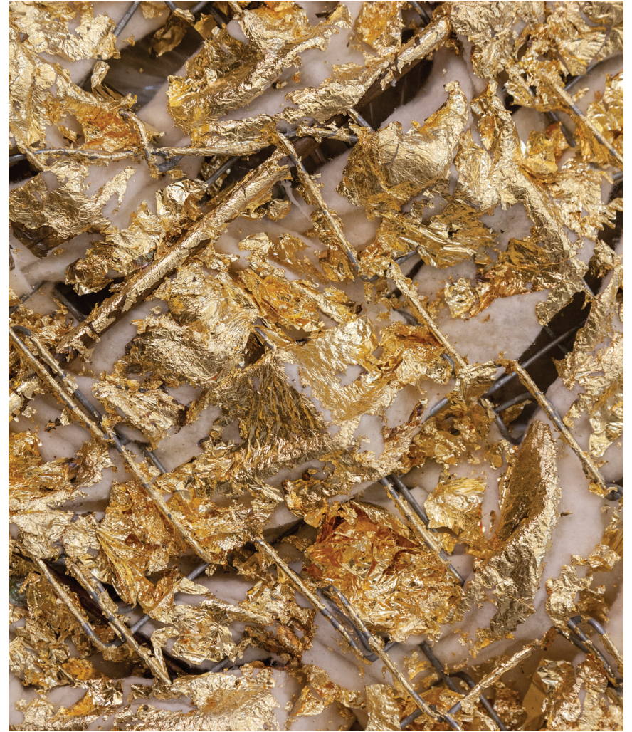
Detail of gold leaf applied over fabric woven through a chain link fence. © Henry Taylor, in collaboration with The Fabric Workshop and Museum, Philadelphia. Nothing Change, Nothing Strange , 2023.