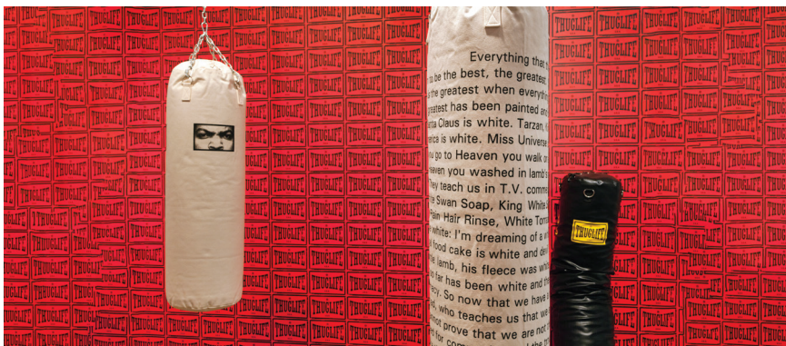
Glenn Ligon, in collaboration with The Fabric Workshop and Museum, Philadelphia, Skin Tight (Thuglife II) , 1995.