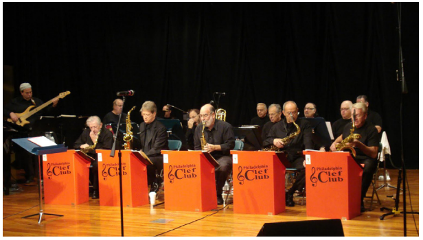
Above: Philadelphia Clef Club Community Big Band

Join our membership program today to enjoy a wide range of year-round benefits while supporting the Philadelphia Clef Club of Jazz & Performing Arts award-winning music education and public programs. Your membership fee will be tax-deductable.