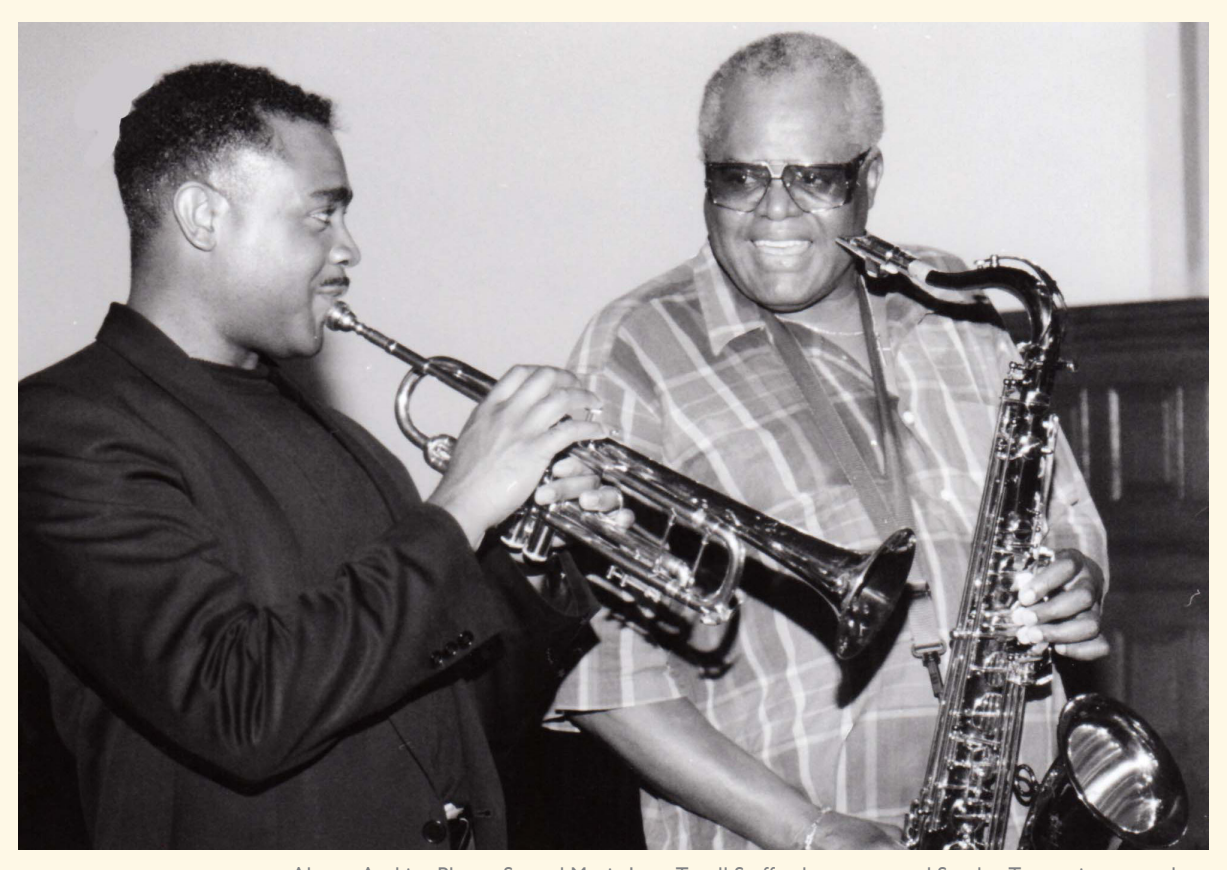
Above: Archive Photo: Sacred Music Jazz: Terell Stafford, trumpet and Stanley Turreutine, saxophone

Its present facility, a new four-story building on the Avenue of the Arts, opened in 1995. The center is located at Broad and Fitzwater Streets and houses a cabaret and performance space, archives, classrooms and rehearsal rooms. The William Penn Foundation was the first investor that enabled the Clef Club to evolve into a prominent music venue, by providing operating and capital support.