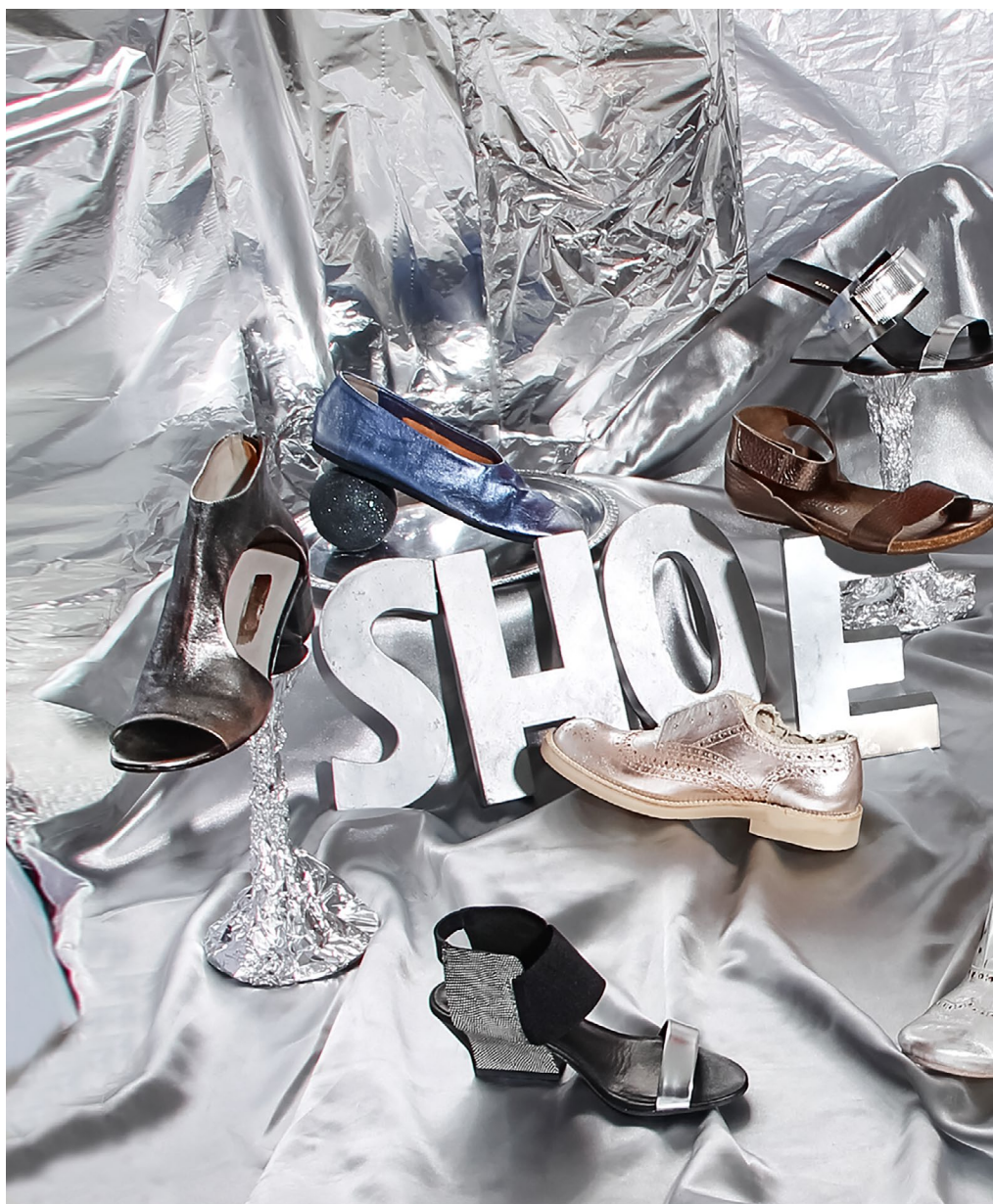
from left to right- MARSELL gun metal cut-out boot, MARSELL blue metallic oxford, PEDRO GARCIA metallic copper sandal, UNITED NUDE silver loafer, MARSELL curved heeled sandal, MARSELL silver desert boot, sandal, UNITED NUDE desert boot, TRIPPEN purple metallic heeled