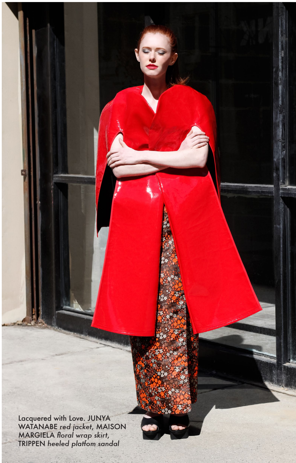
Lacquered with Love. JUNYA WATANABE red jacket, MAISON MARGIELA floral wrap skirt, TRIPPEN heeled platform sandal