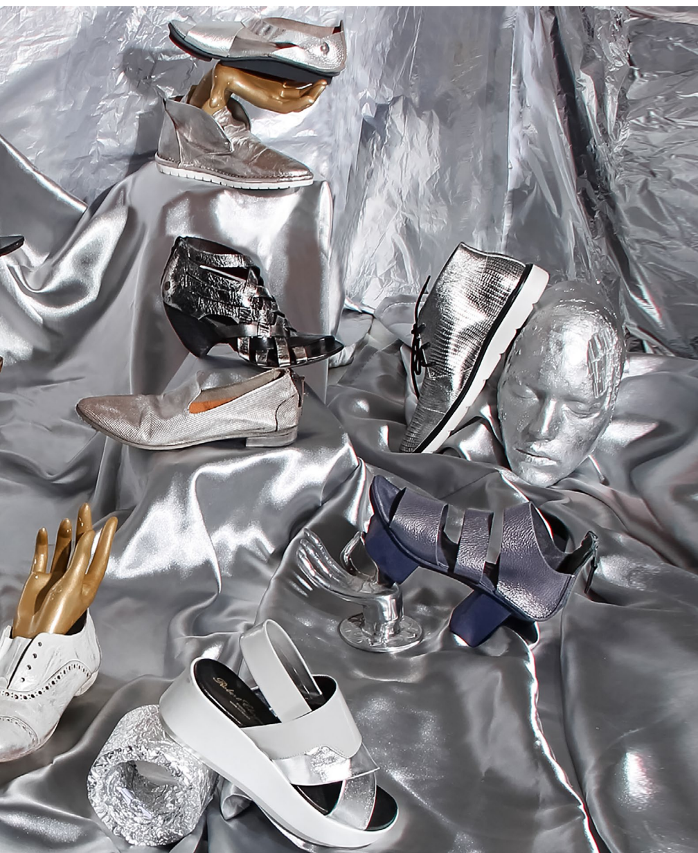
metallic flat, UNITED NUDE textured heeled sandal, PEDRO GARCIA geometric silver heeled sandal, MARSELL pearl silver brogue, MARSELL TRIPPEN silver cross strap sandal, ROBERT CLERGERIE silver platform sandal