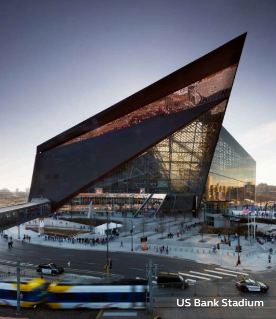
US Bank Stadium