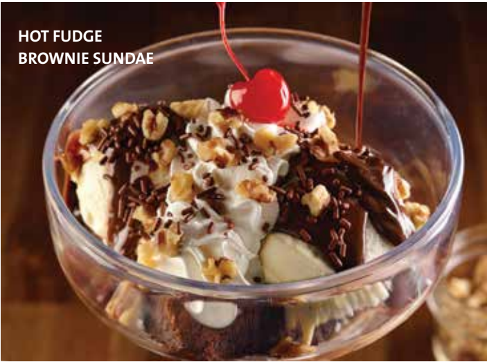
HOT FUDGE BROWNIE SUNDAE

BAKER'S CHOICE Seasonally priced Ask about today's special dessert!